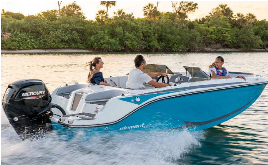
Element M17 Deck Boat